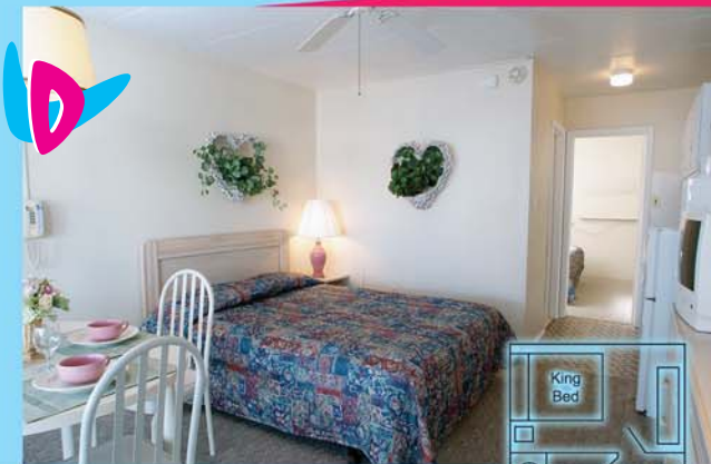
2 Room Eff. Suite with 1 King bed and 1 Queen bed