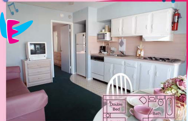
Large 2 Room Efficiency Suite with 2 Double beds and 1 Sofabed

"...AND DARLING, SAVE THE LAST DANCE FOR ME..."