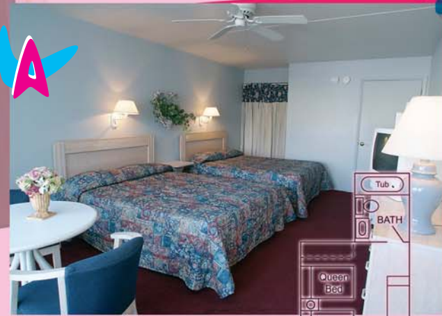
Motel Room with 2 Queen Beds

The Caprice Motel offers 6 unique rooms and efficiencies to fit your needs.