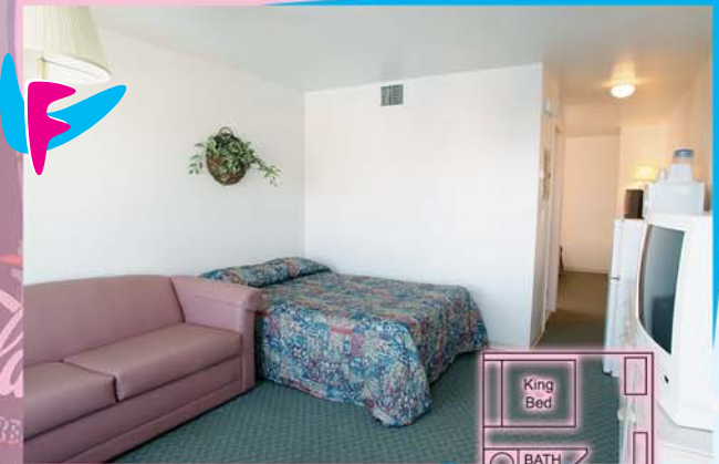
2 Room Suite with 1 King bed, 1 Double bed, 1 Sofabed and Central Air