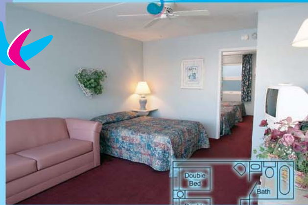
2 Room Suite with 3 Double Beds and 1 Sofabed

"...ONE O-CLOCK, TWO O-CLOCK THREE O-CLOCK ROCK..."