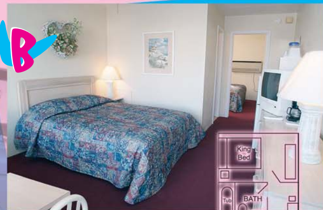
2 Room Suite with 1 King Bed and 1 Queen Bed